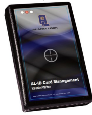
AL-IDRW Card Write-ReWriter

The AL Card Management Suite software is a subset of DL-Windows V5.5.4, and provides a simplified user interface intended for use by any authorized person (such as a doorman in an apartment building). They can easily add, delete and replace proximity cards without needing to be familiar with the full workings of DL-Windows .