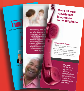
Free Sales Trifold Mailers for New & Existing Accounts (Part No. A606)

SLE-GSM-FIRE: Fire Alarm Cellular Communicator (Red), model similar to above.